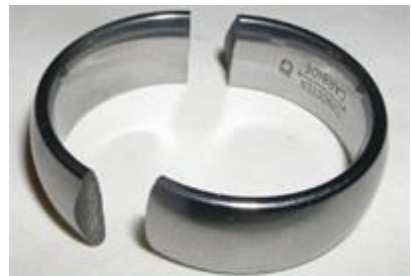
Divorce & Finance