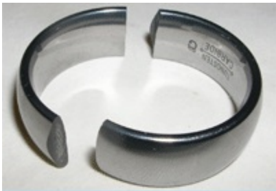
Divorce & Finance