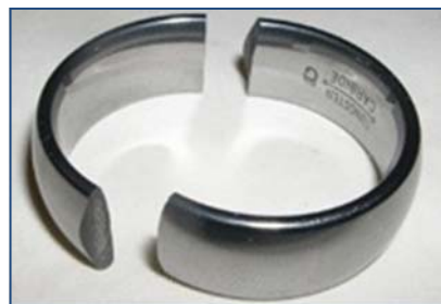
Divorce & Finance